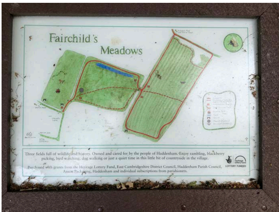
Pippa Keynes 10th July 2023